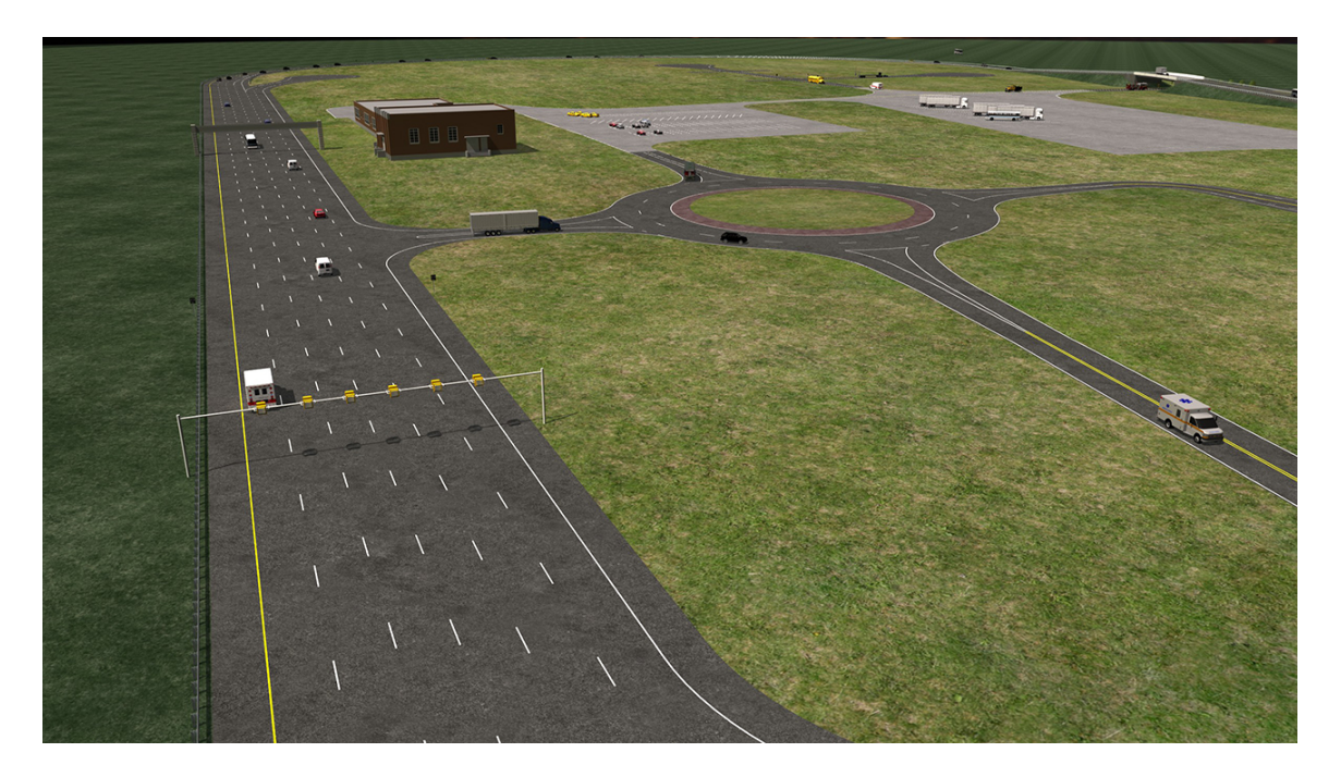
Figure 4: Three artist 3D renderings of the PennSTART training facility in State College, PA. (Courtesy of the Pennsylvania Turnpike Commission.)

During this portion of the workshop, Bruce Trego, acting Pennsylvania State Fire Commissioner, made brief remarks to the group.