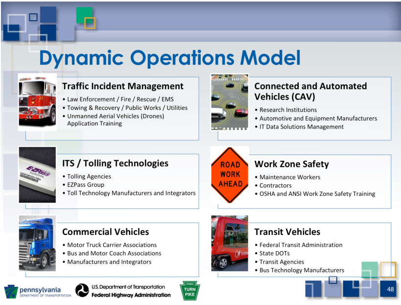
Figure 2: PennTIME Dynamic Operations Model.

PennTIME uses a Dynamic Operations Model: